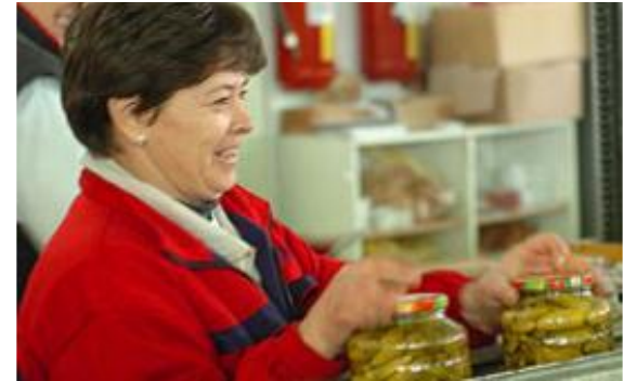
Financial management system for Vegafruit factory in Sarajevo