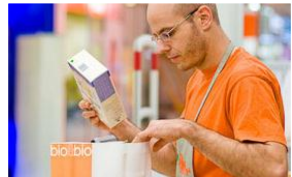
Category management & business plan for Biovega, a Croatian retailer